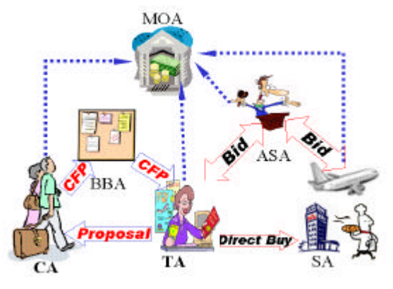
Figure 1: TAGA Architecture

TAGA provides a flexible framework to run the travel market game. Figure 1 show the structure of TAGA. The collaboration and competition among six types of agents who play different market roles simulate the real world travel market. We find that basing our implementation on FIPA compliant agent platforms has made the framework extremely flexible. We'll briefly describe the different agents in our initial TAGA game.