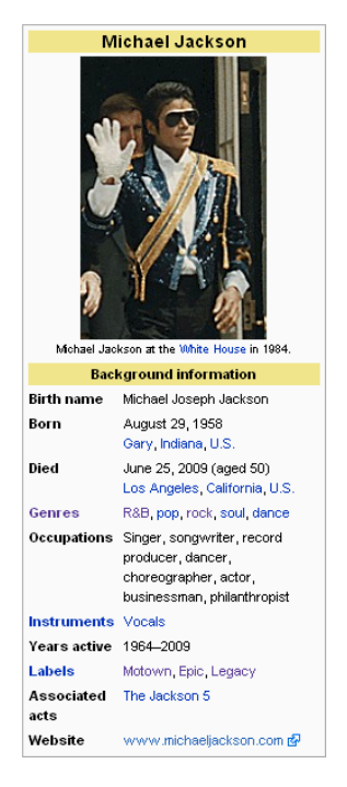
Figure 2. The Wikipedia infobox for the Michael_Jackson article has a number of slots from appropriate infobox templates.

to categorize them. The article on Michael Jordan, for example, has 36 categories associated with it. In order to select an individual WordNet synset as a label for the concept's type, we use two heuristics: